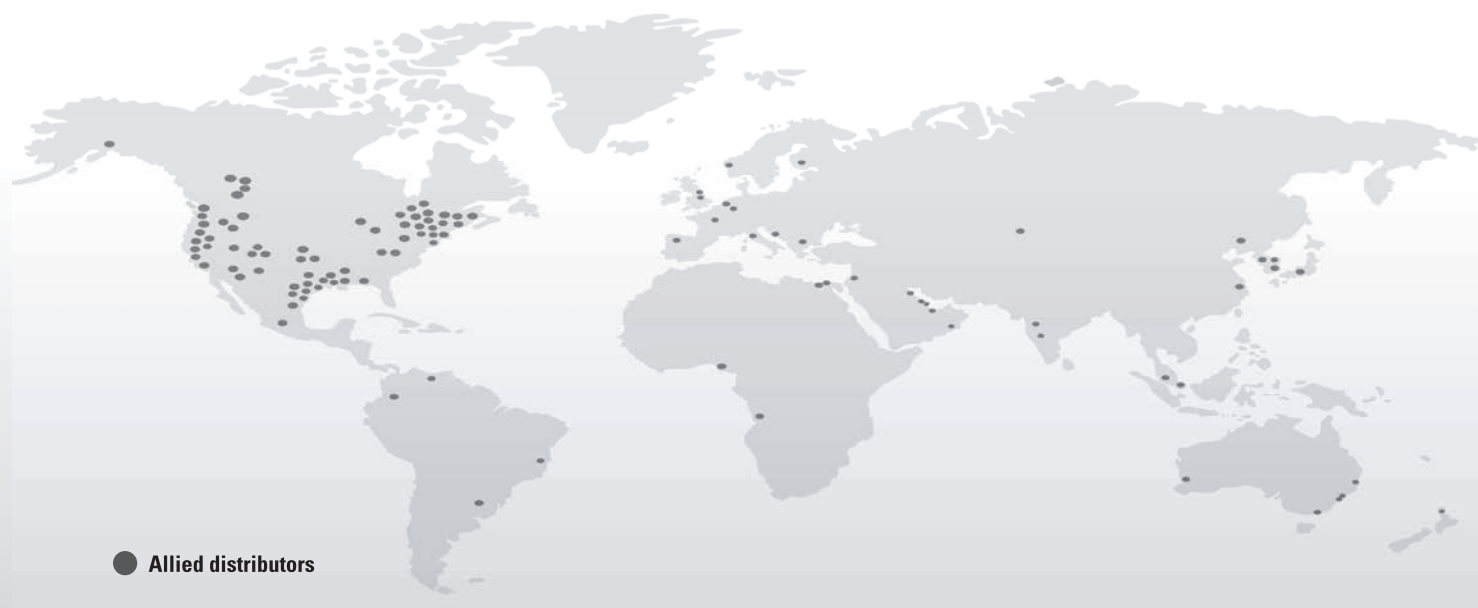
● Allied distributors

Based on sales and geographic reach, the Flexitallic Group has become the global supplier of industrial gaskets.